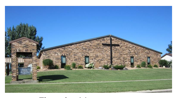
Thursday Mass: 9:00 a.m.

8:30 a.m. (Feb-Apr-Jun-Aug-Oct-Dec) 10:30 a.m. (Jan-Mar-May-Jul-Sep-Nov)