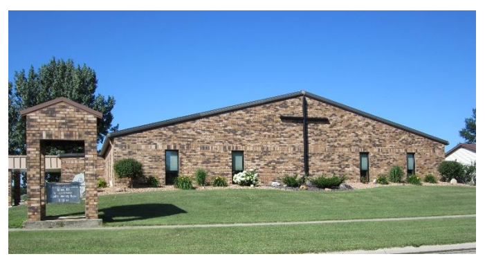
Thursday Mass: 9:00 a.m.

8:30 a.m. (Feb-Apr-Jun-Aug-Oct-Dec) 10:30 a.m. (Jan-Mar-May-Jul-Sep-Nov)