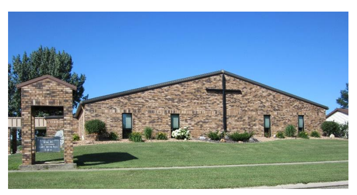
Thursday Mass: 9:00 a.m.

8:30 a.m. (Feb-Apr-Jun-Aug-Oct-Dec) 10:30 a.m. (Jan-Mar-May-Jul-Sep-Nov)