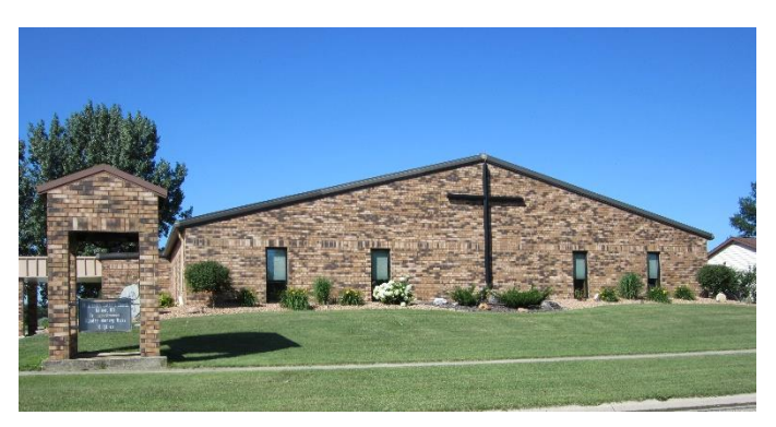
Thursday Mass: 9:00 a.m.

8:30 a.m. (Feb-Apr-Jun-Aug-Oct-Dec) 10:30 a.m. (Jan-Mar-May-Jul-Sep-Nov)