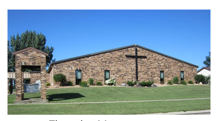
Thursday Mass: 9:00 a.m.

8:30 a.m. (Feb-Apr-Jun-Aug-Oct-Dec) 10:30 a.m. (Jan-Mar-May-Jul-Sep-Nov)