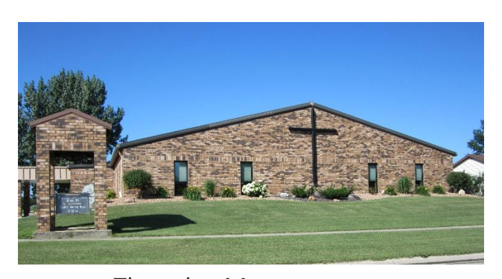
Thursday Mass: 9:00 a.m.

8:30 a.m. (Feb-Apr-Jun-Aug-Oct-Dec) 10:30 a.m. (Jan-Mar-May-Jul-Sep-Nov)