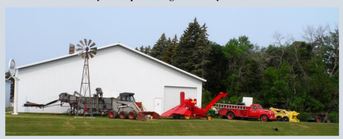
Grain for Goodness

Grain for Goodness is a program that Full Circle Ag has to help support their local communities. The Sargent County Museum in Forman, ND has applied for the program and is conditionally approved. They had a building that received too much snow on it with the last snowstorm in April and on April 6, 2023 their building number 3 which housed the story of farm equipment collapsed under the weight of the snow. They were under insured and insurance will only cover 48% of the cost to rebuild the building as it stood. They would like to rebuild next summer and need to raise the funds to do this. As a member owned cooperative Full Circle Ag has the ability to help out in these types of situations. Just as member - owners' partner with them for their crop inputs, they also believe in returning the loyalty by partnering to support their local communities. If you do business with Full Circle Ag ask them how you can help the Sargent County Museum. Full Circle Ag will match your contribution plus they will contact Land O Lakes for a match also which means your contribution as a farmer will be tripled! So, you give $250 and the Museum will get $750. Contact Kelli Erickson at 605-824-6949 to sign up and for more details. Just one more way you can help the Sargent County Museum rebuild!