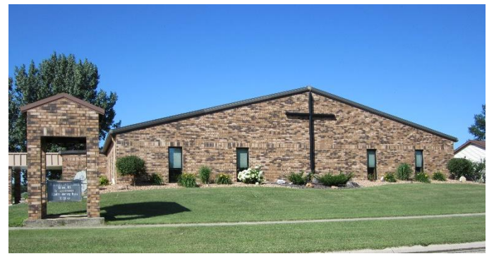
Thursday Mass: 9:00 a.m.

Sunday Mass: 8:30 a.m. (Feb-Apr-Jun-Aug-Oct-Dec) 10:30 a.m. (Jan-Mar-May-Jul-Sep-Nov)