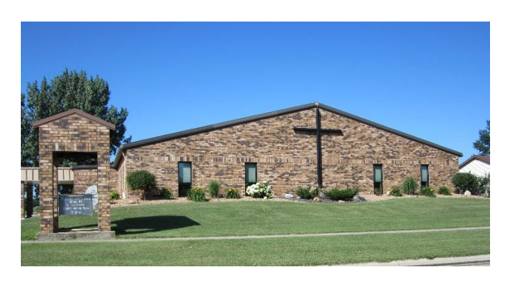
Thursday Mass: 9:00 a.m.

8:30 a.m. (Feb-Apr-Jun-Aug-Oct-Dec) 10:30 a.m. (Jan-Mar-May-Jul-Sep-Nov)