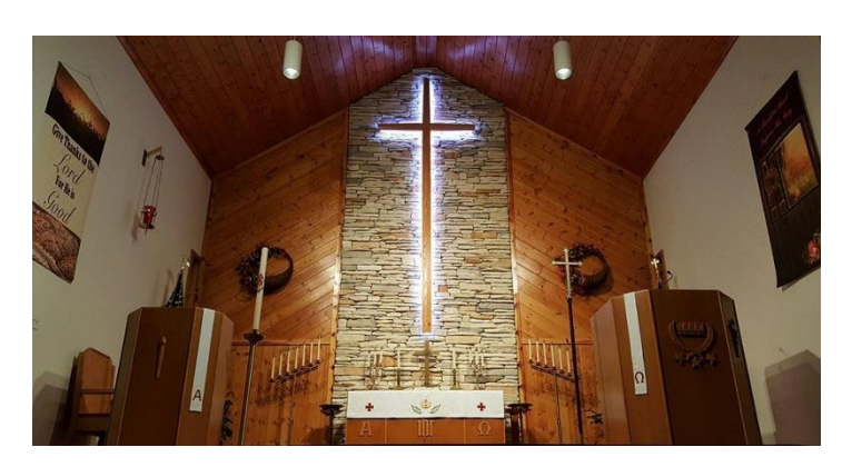
Thursday Mass: 9:00 a.m.

8:30 a.m. (Feb-Apr-Jun-Aug-Oct-Dec) 10:30 a.m. (Jan-Mar-May-Jul-Sep-Nov)