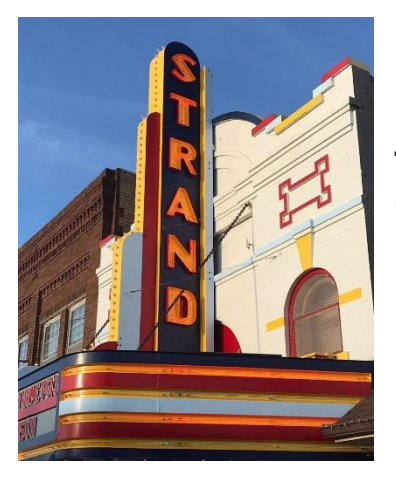
The Strand Theatre, Britton SD 703 Main Street