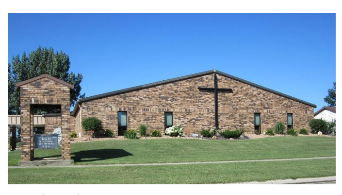
Thursday Mass: 9:00 a.m.

Sunday Mass: 8:30 a.m. (Feb-Apr-Jun-Aug-Oct-Dec) 10:30 a.m. (Jan-Mar-May-Jul-Sep-Nov)