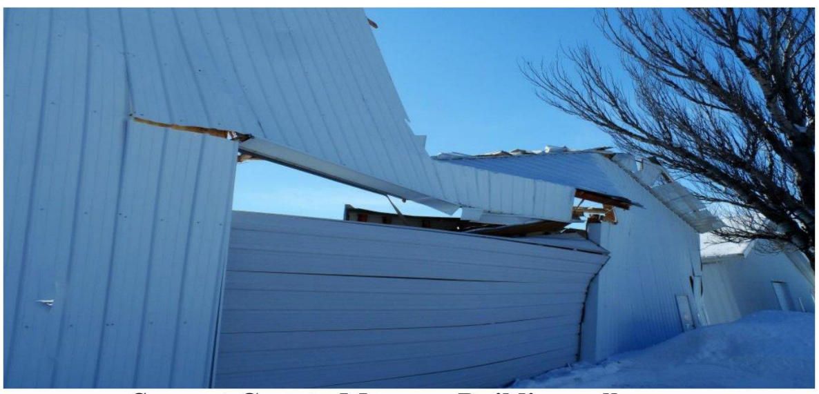
Sargent County Museum Building collapses

On April 6, 2023 at about 1am the alarm went off at the Sargent County Museum in Forman, ND. It was found that due to the snow at the last storm the roof of what we call building 3 collapsed. This is the building that houses the farm equipment, newspaper exhibit, cook car, Forman Fire Truck, 3 Bobcats & an old time score clock made with tin cans. The contents at the museum are not insured due to the cost of it since they are mostly irreplaceable items. We are under insured which will mean we need to come up with more funds to rebuild. Our hopes at this time are to remove what the museum owns and put small items in building 4 and the rest outside the buildings on the east end by the highway. Those items that were on loan in the building will be removed and stored by those owners. We then hope to start the rebuilding as soon as possible which may mean taking out a loan to get us going again. As you may know this building had a gravel base floor with wooden sidewalks, exhaust fans on a timer to remove the hot air in the summers during the evenings, overhead lighting, a security system, phone system, 2 oversized overhead doors on each end and 2 service doors to go outside plus the connecting halls on each end leading to the next building. You can find photos of the mess at our FB page (Sargent County Museum) it also has the clips the news channels did on us and one a local YouTube channel person (Dylan Ekstrom) did.