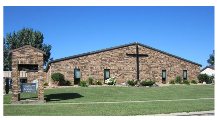
Thursday Mass: 9:00 a.m.

Sunday Mass: 8:30 a.m. (Feb-Apr-Jun-Aug-Oct-Dec) 10:30 a.m. (Jan-Mar-May-Jul-Sep-Nov)