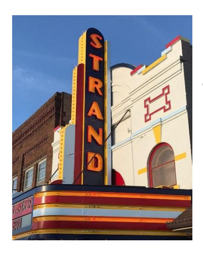
The Strand Theatre, Britton SD 703 Main Street