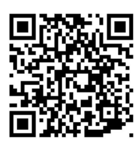
Register by scanning this QR Code or visit www.ndsu.edu/agriculture/extension/field-fork

The Field to Fork Wednesday Weekly Webinars will begin Feb. 15. and held online from 2 to 3 p.m. Wednesdays through April 26.