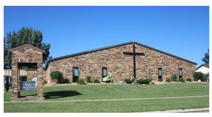
Thursday Mass: 9:00 a.m.

Sunday Mass: 8:30 a.m. (Feb-Apr-Jun-Aug-Oct-Dec) 10:30 a.m. (Jan-Mar-May-Jul-Sep-Nov)