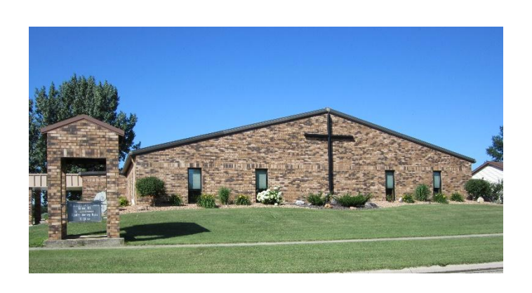
Thursday Mass: 8:30 a.m.

8:30 a.m. (April through September) 10:30 a.m. (October through March)