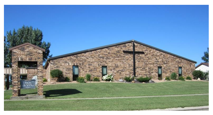
Thursday Mass: 8:30 a.m.

8:30 a.m. (April through September) 10:30 a.m. (October through March)