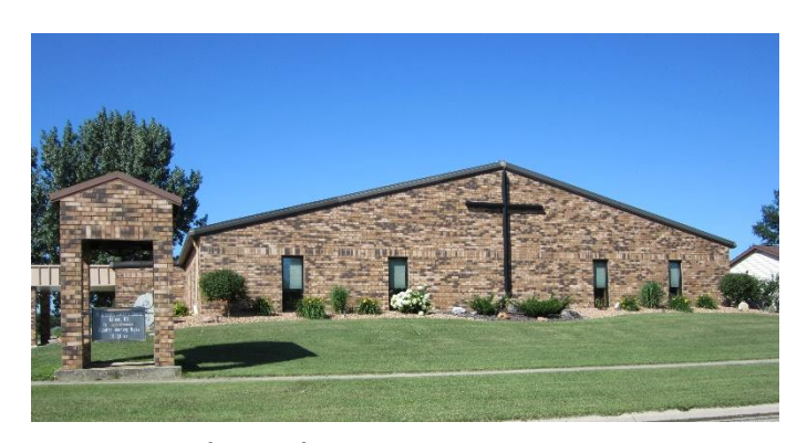
Thursday Mass: 9:00 a.m.

--Sunday, June 2, Mass will be at 7 p.m. -- NO morning Mass.