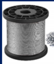
Wire Rope, 1/16 Wire Rope, Stainless Steel 304 Wire Cable, 328FT Length Aircraft Cable with 100pcs Sleeves Stops, 7x7 Strand Core, 368 lbs Breaking Strength This pkg is on Amazon for $20.99

The wire rope needed is to hang the Bobcat fabric from the ceiling to highlight the Bobcats. Also, will be needing 3/4 inch conduit for this project not sure on amount yet. We may have other items in the future coming up. Arrangements will be made for drop off when you contact us.