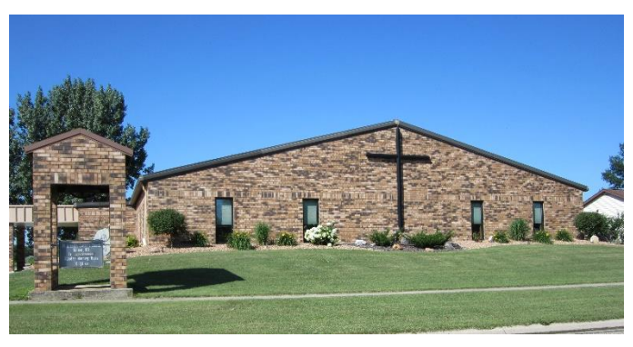
Thursday Mass: 9:00 a.m.

8:30 a.m. (Feb-Apr-Jun-Aug-Oct-Dec) 10:30 a.m. (Jan-Mar-May-Jul-Sep-Nov)