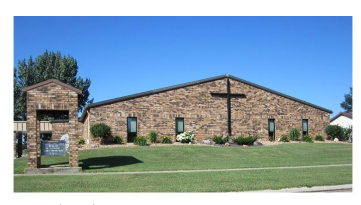
Thursday Mass: 9:00 a.m.

Sunday Mass: 8:30 a.m. (Feb-Apr-Jun-Aug-Oct-Dec) 10:30 a.m. (Jan-Mar-May-Jul-Sep-Nov)