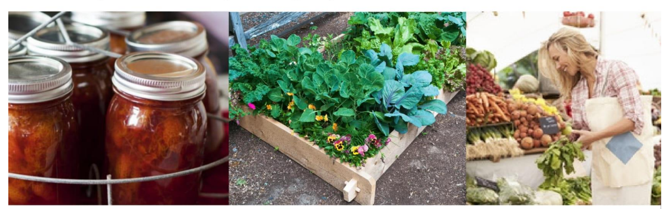
Register by scanning this QR Code or visit <u>www.ndsu.edu/agriculture/</u> <u>extension/field-fork</u>

The Field to Fork Wednesday Weekly Webinars will begin Feb. 15. and held online from 2 to 3 p.m. Wednesdays through April 26.