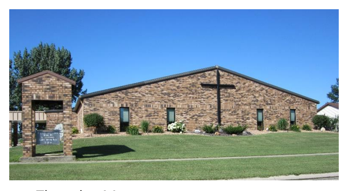
Thursday Mass: 9:00 a.m.

Sunday Mass: 8:30 a.m. (Feb-Apr-Jun-Aug-Oct-Dec) 10:30 a.m. (Jan-Mar-May-Jul-Sep-Nov)