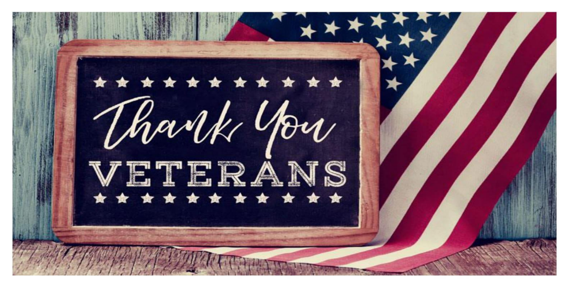
Come join us for our Veteran's Day service

The American Legion Post #82 will be holding a Veteran's Day program for Friday, November 11<sup>th</sup> at 11 am in Forman located at City Hall.