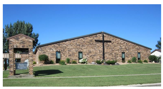
Thursday Mass: 9:00 a.m.

Sunday Mass: 8:30 a.m. (Feb-Apr-Jun-Aug-Oct-Dec) 10:30 a.m. (Jan-Mar-May-Jul-Sep-Nov)