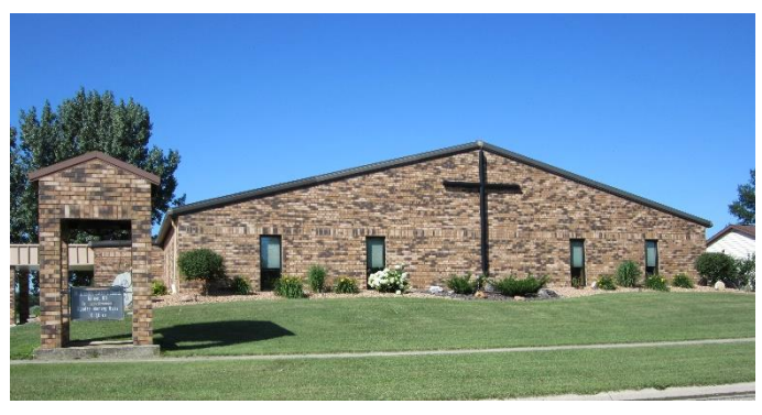
Thursday Mass: 9:00 a.m.

Sunday Mass: 8:30 a.m. (Feb-Apr-Jun-Aug-Oct-Dec) 10:30 a.m. (Jan-Mar-May-Jul-Sep-Nov)